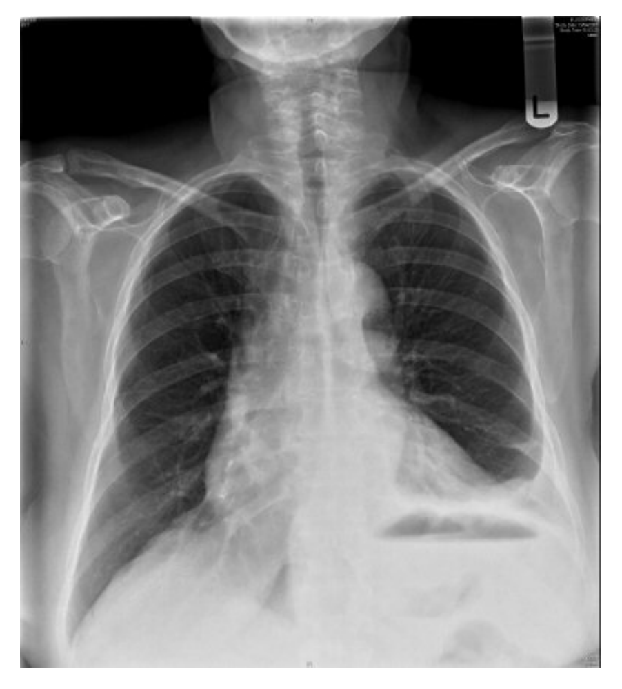
Left basal pleural effusion and consolidation