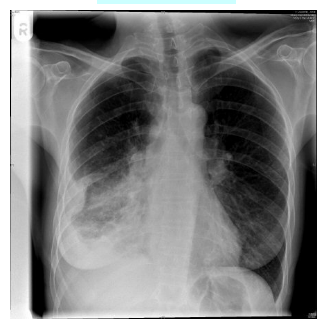
Right pleural metastases and pleural effusion due to carcinoma of the ovary

Pass this Bulletin to Healthcare Professionals in the Hospital near you in Southern Sudan. Published by Healthcare Association of Southern Sudan (HASS)