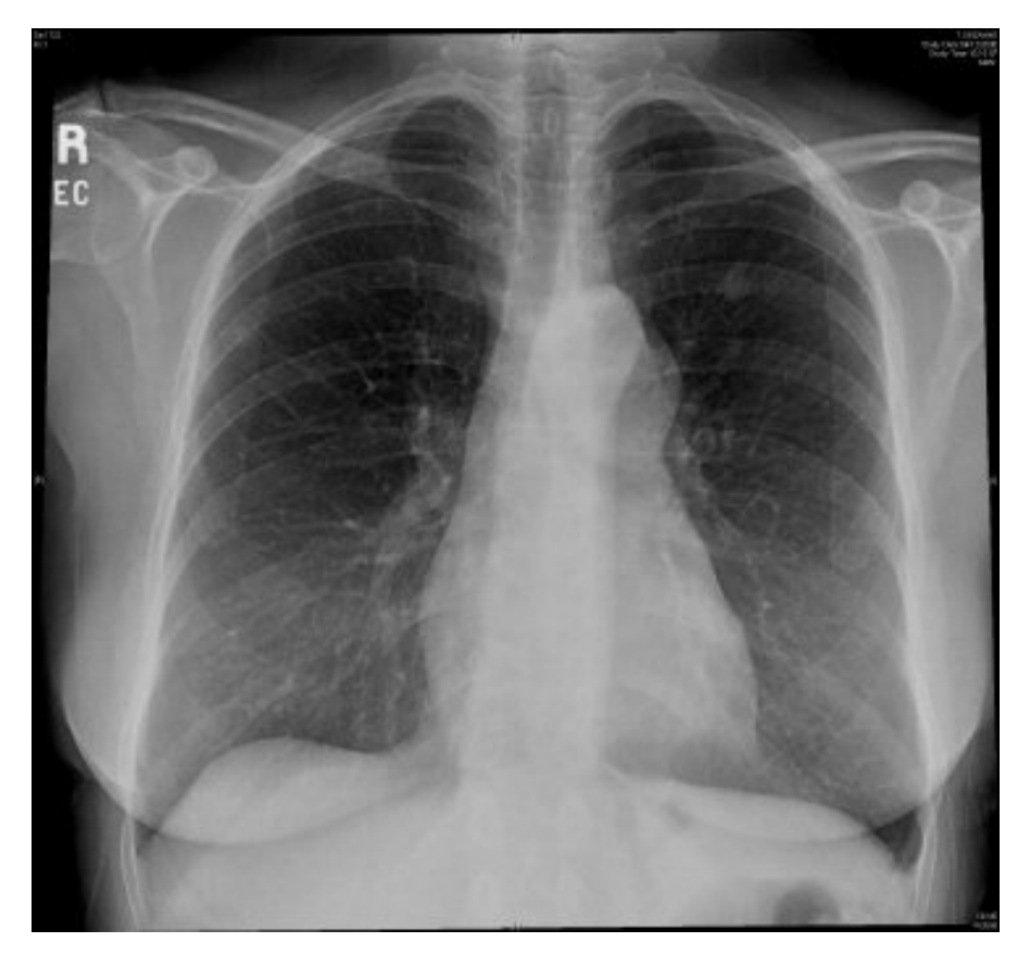
Left mid mediastinal / paraaortic tumour and left upper lobe satellite lesion