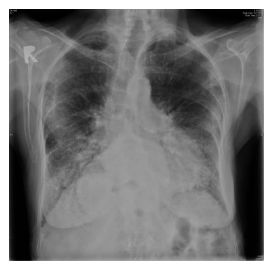
Pulmonary fibrosis and superimposed infection